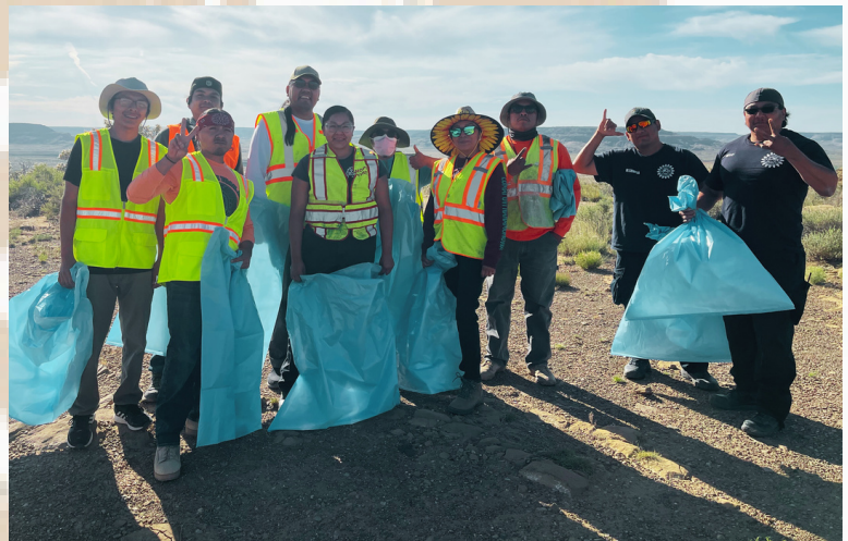
HLP Highway Clean Up 2023

The Hopi Leadership Program is currently focusing on preparations for the upcoming 2024 HLP cohort. The HLP staff is working on incorporating objectives that resulted from completion of our strategic plan. This includes revising our program's curriculum that will focus on topics that are relevant to the Hopi community in areas of cultural and professional development. HLP staff is also currently working toward hosting an outdoor cultural field trip for the Hopi Youth Leadership Program.