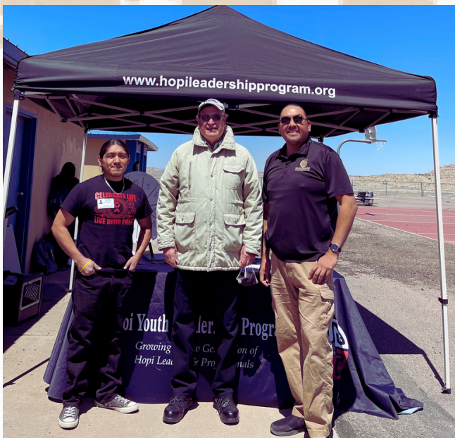
Hopi Youth Leadership Program Recruitment Booth at Hopi Jr/Sr High School

The schedule was from April 24th - May 4th Monday - Thursday 3:30pm - 4:45pm and hosted in the HJSHS library. The learning objective of week one involved Cultural Well-being, Identity and introducing the concepts of colonization and decolonization. Week two was directed towards Mentoring and Service Learning. Using a method called True Colors, students were provided an opportunity to become more familiar with their individual personality traits and also explore ideas about what job fields and careers they could possibly excel in based on these personality traits.