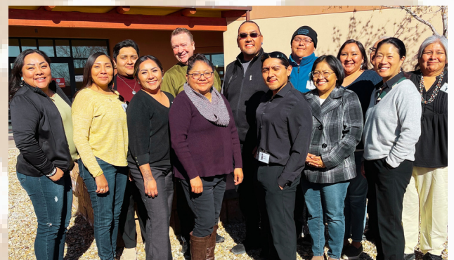
Hopi Leadership Program Strategic Planning Session