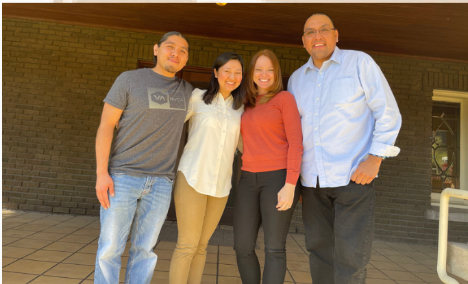
HLP Staff with AZ Humanities Staff