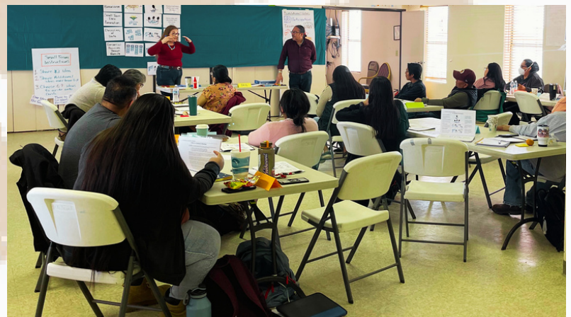
TOPS Facilitation Training

On March 20, 2023 the final stages to complete the HLP strategic plan were conducted alongside the Hopi Foundation administration team at the Moenkopi Legacy Inn. The HLP staff mapped out the coming months of 2023 and is prepared to address components that will enhance programming for the start of the next incoming leadership cohort.